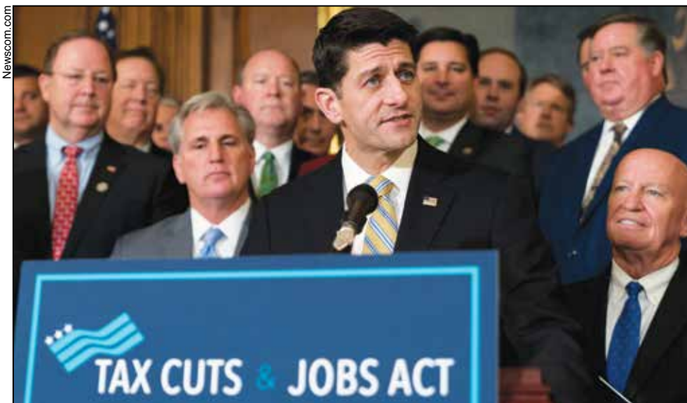
No Federal rollback on GOP table: House Speaker Paul Ryan claimed the “Tax Cuts and Jobs Act” was “the single biggest thing we can do” to help struggling Americans.