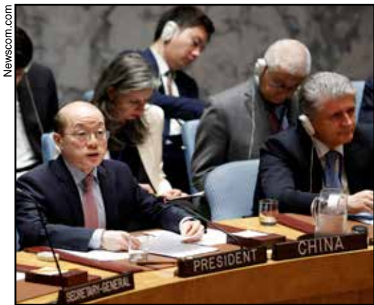
Unexposed scam: Communist China now holds the presidency at the UN Security Council — the U.S. go-to body for CFR world order.

Those perpetrating the Con-con fraud have been hard at work this past year,