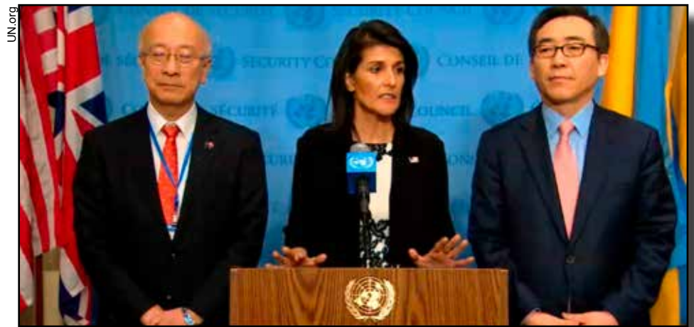
Embracing authority of Internationalist UN: After a Security Council Meeting to discuss N. Korean missile launching, U.S. Rep Nikki Haley briefs the press with Reps from Japan (L) and S. Korea (R).

Of the U.N.’s longstanding and pervasive anti-Israel bias, Haley told reporters that Washington is staking out a firm new position: “I’m here to say the United States will not turn a blind eye to this anymore.... I’m here to emphasize the United States is determined to stand up to the U.N.’s anti-Israel bias.” — USNews.com, 3-7-17